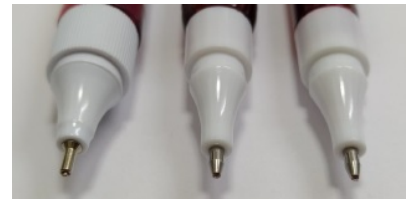
Left to right: LabNed PAP-Pen Flat (7ml), Classic (7ml) and Classic (3ml)