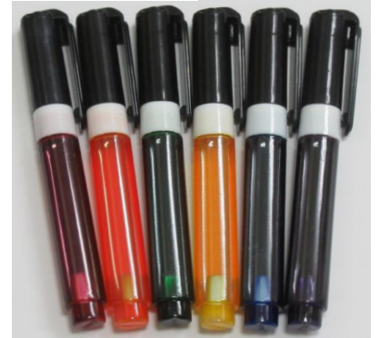
LabNed PAP-Pen Classic

* BarrierPaste only available on request